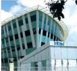
INFOSYS 5.4 KM | 10 Min Drive