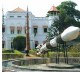
VSSC 3.2 KM | 8 Min Drive