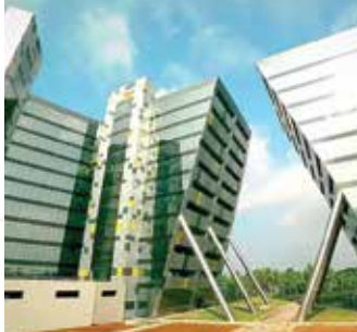
TECHNOPARK : 3.5 KM | 8 Min Drive