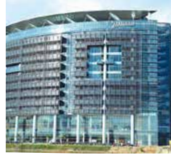
UST GLOBAL 4.8 KM | 10 Min Drive