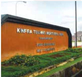
KINFRA 850 M | 3 Min Drive