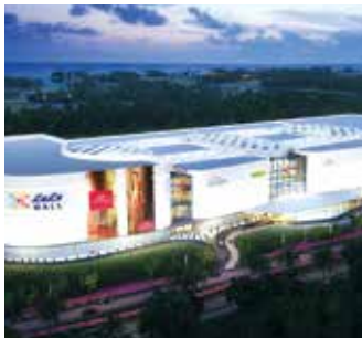
LULU HYPER MARKET 5.4 KM | 13 Min Drive